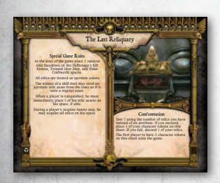
3 Scenario Sheets