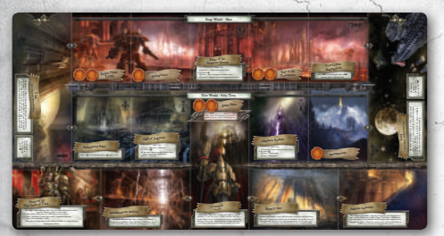
1 Sol System Game Board