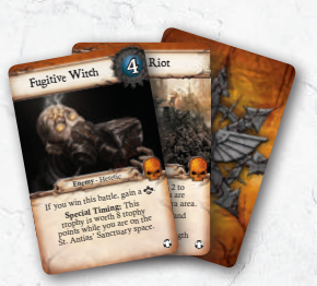
40 Orange Threat Cards