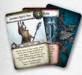
12 Blue, Red, and Yellow Threat Cards