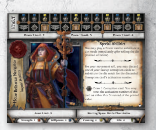
3 Character Sheets