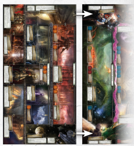
Sol System Board

1. Place Game Board: Unfold and place the Sol System board in the play area as shown in the diagram below. The Sol System board must be next to the base game's board so that the Luna space is adjacent to the Battlefleet Antias space and so the Titan space is adjacent to the Grey Knight Envoy space. The Sol System board functions as an extension of the board from the Relic base game, adding new tiers for players to explore.